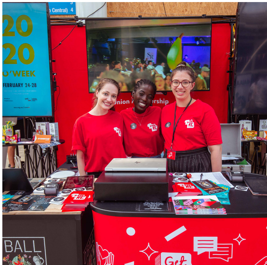
Above: Membership sales stall at O'Week 2020

Membership numbers decreased in 2020, with total membership sitting at 4,071 at years end. This represented an overall decline of 6.63% from the 2019 figure of 4,360 members. When multi-year carryover memberships are excluded from these figures the real decline was more severe with 27% fewer memberships sold in 2020 than in 2019. Enrolment losses, and the shift to remote study were primary drivers for this decrease, and it is hoped that 2021 will see a return to a more stable student experience and a return to membership growth.