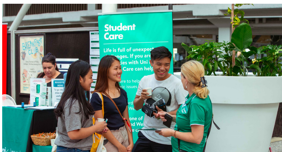
Below: Student Care information stall at O'Week 2020

Supporting students experiencing financial hardship as a result of COVID-19 was also a prominent feature of work in Semester 2.