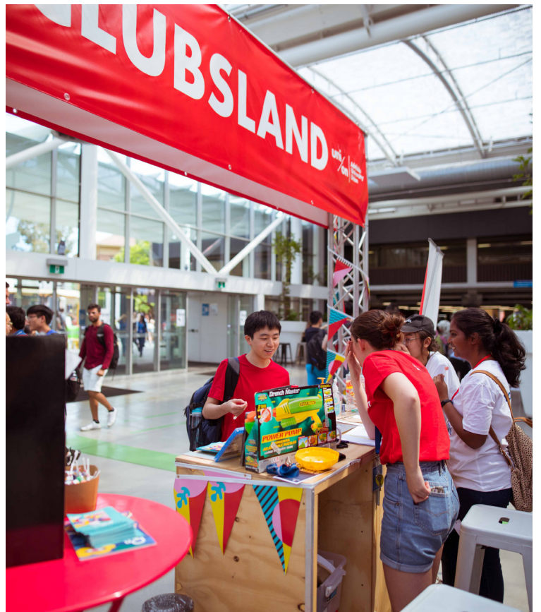
Right: Clubsland information stall