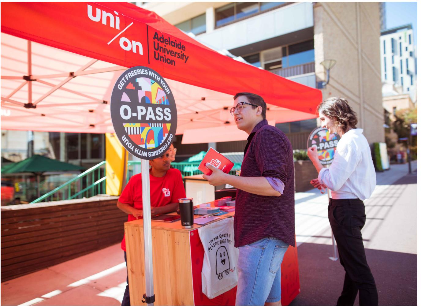
Above: Membership Stall at O'Week 2020