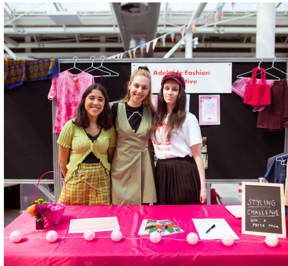
Above: Adelaide Fashion Collective stall at O'Week 2020

Thank you to the Committee for their time and consideration of Clubs matters throughout the year.