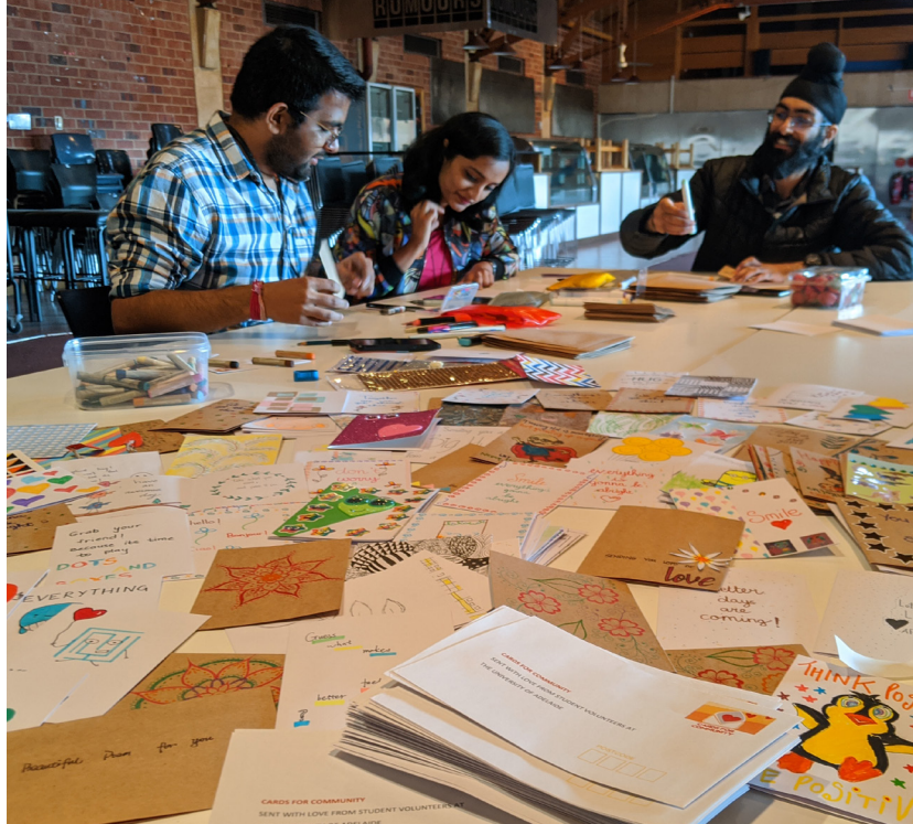
Right: Cards for Community activity