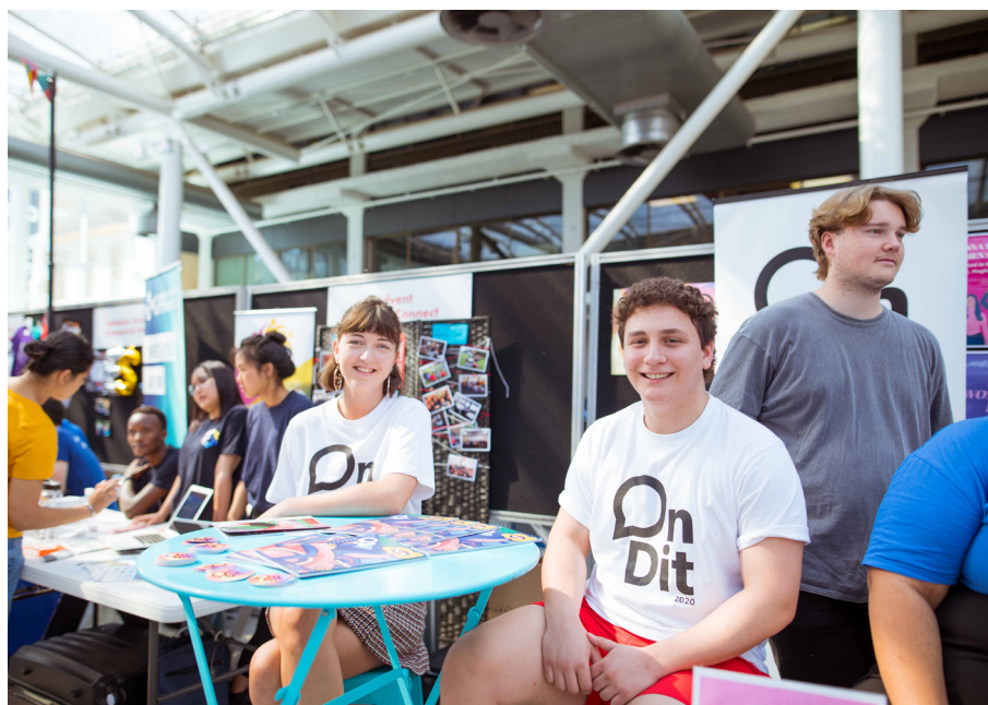
Above: On Dit stall at O'Week 2020

On Dit went to great lengths to ensure that under-represented groups were represented within the magazine. A column apiece was reserved for international and rural student contributions, and the Clubs Spotlight regular feature highlighted the best of the University of Adelaide's clubs and their contribution to campus culture.