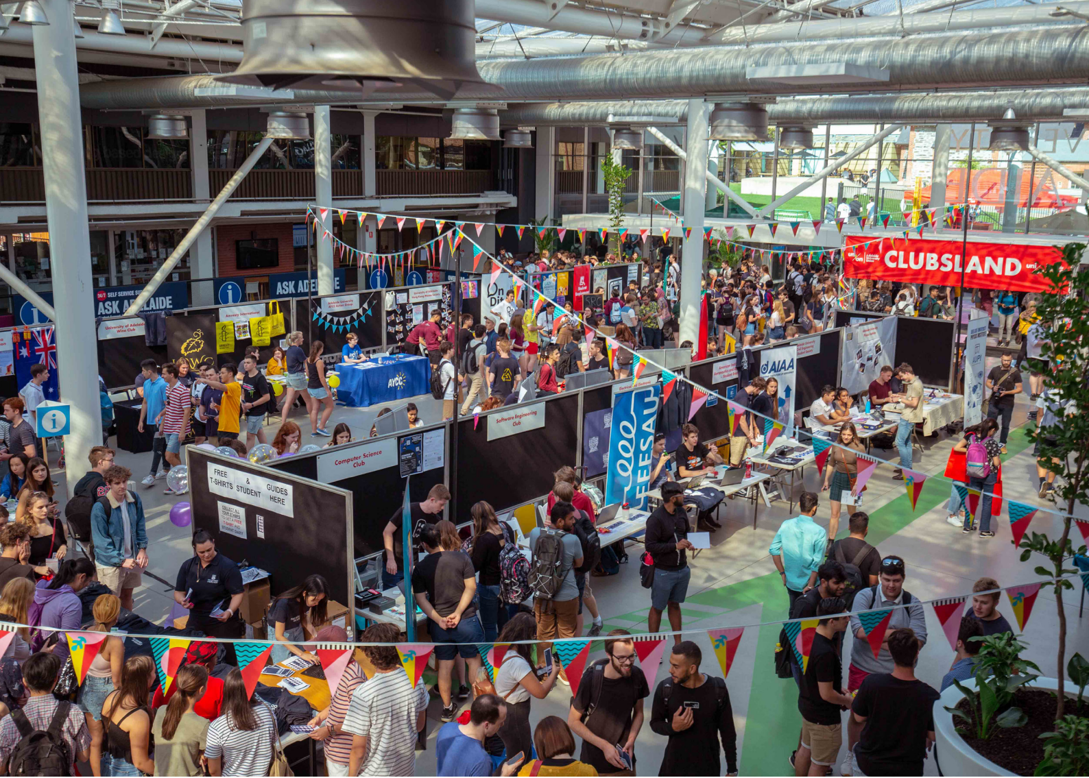
Above: Clubsland in Hub Central