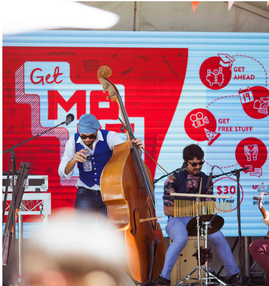
Above: Main stage entertainment at O'Week 2020

O'Night was delivered again at Roseworthy in the twilight timeframe from 4-6pm on the Corridor Block Lawns in the second week of Semester 1. Both Clubs and commercial stallholders increased in 2020 and approximately 320 students came through the event – about a 15% increase on attendance from 2019.